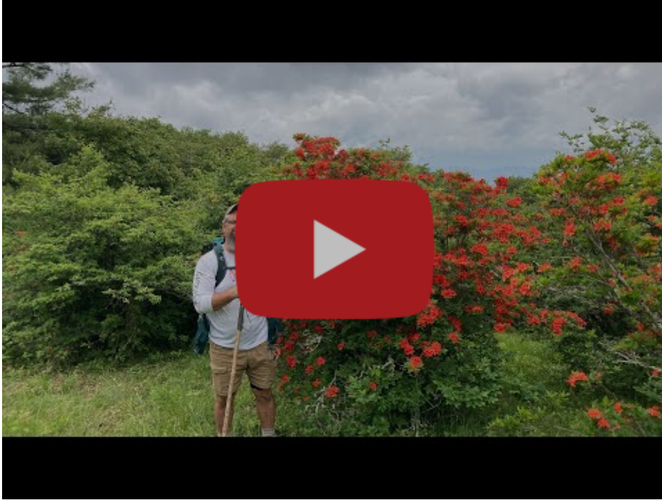
The Native Azaleas on Gregory Bald