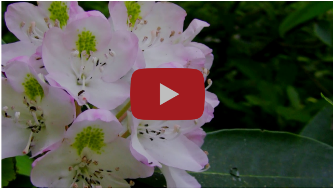
R. maximum in the Great Smoky Mountains National Park