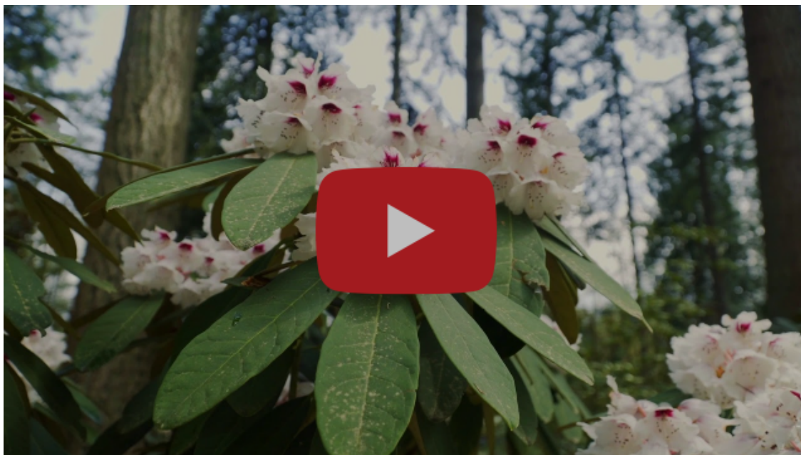
Overview of the Rhododendron Species Botanical Garden