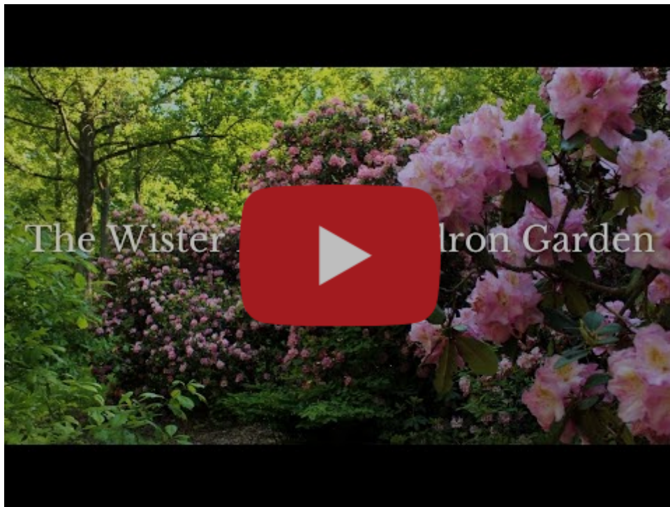
The Wister Rhododendron Garden at Tyler Arboretum