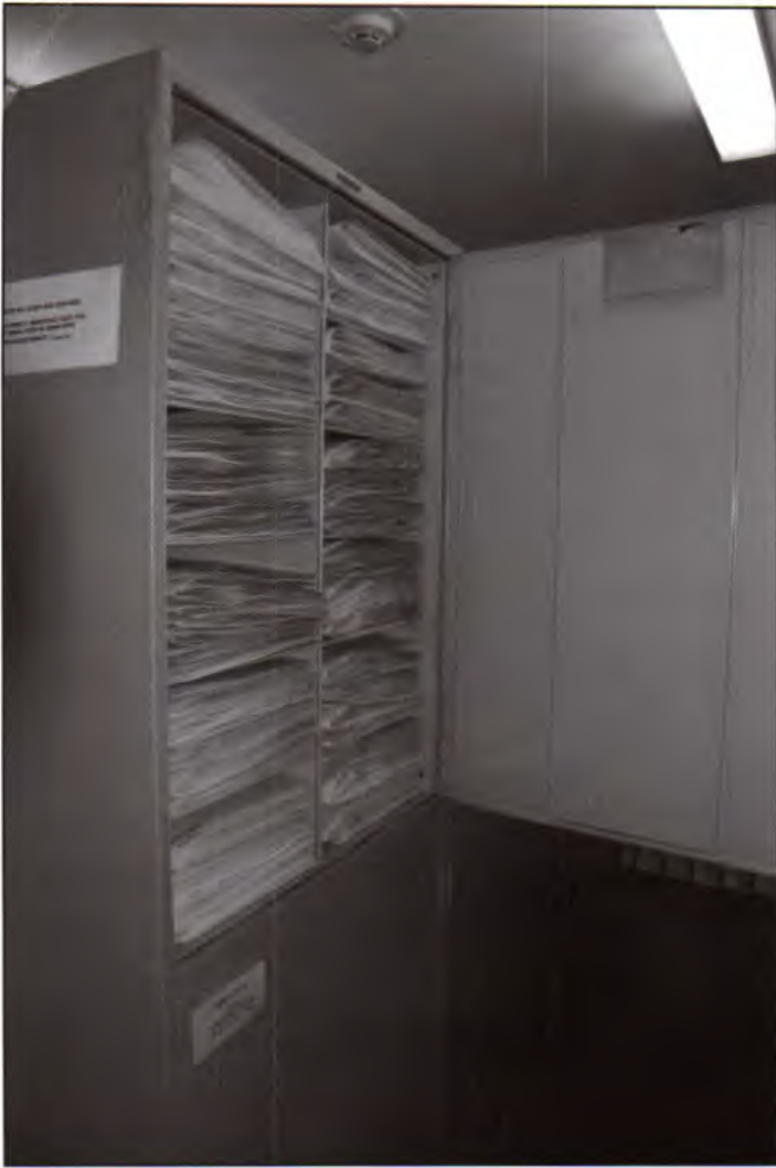
▲ Skinner's herbarium collection is housed at the Morris Arboretum.