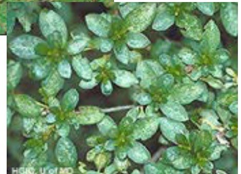
Andromeda lace bug