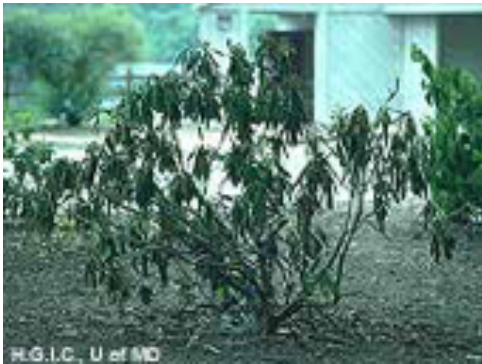
Phytophthora root rot and dieback

Phytophthora dieback, although uncommon in the landscape, is a distinct phase of the Phytophthora disease syndrome on rhododendrons. It can be brought into the landscape on infected plants and can be severe on plants grown under overhead sprinkler irrigation. The disease occurs when the pathogen is splashed onto the foliage. Thus, infected plants may show symptoms on leaves and shoots, but may have healthy root systems. Plants with dieback develop symptoms on the current season growth. Mature leaves are often resistant, however if they become infected, they usually fall prematurely. Infected leaves show chocolate brown lesions that often expand and cause dieback of the shoot tips. Infected leaves droop and curl towards the stem. Diseased leaves remain attached to the stem. Growth of the pathogen through the midrib tissue often produces a V shaped lesion that extends along the leaf midrib into the stem.