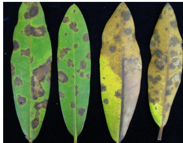
Figure 1. Fungal leaf spot of rhododendron.

pinhead to those that are more diffuse or even coalesce over the entire leaf. Small, black fruiting bodies may be visible on the upper or lower surfaces of the spots (Figure 3).