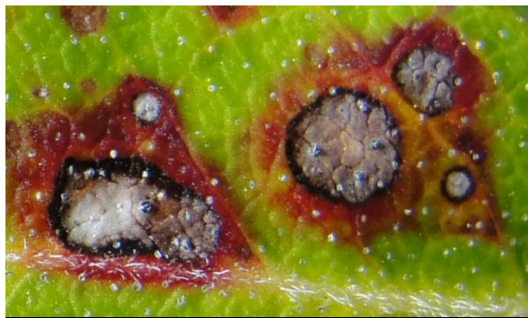
Figure 3. Small, black fruiting structures of the fungus are visible in the leaf spots.

Tan masses of fungal spores can sometimes be seen oozing from the black fruiting bodies after periods of wet weather. These tendrils consist of masses of individual fungal spores that are readily wind- or rain-driven to newly emerging leaves in spring (Figure 4).