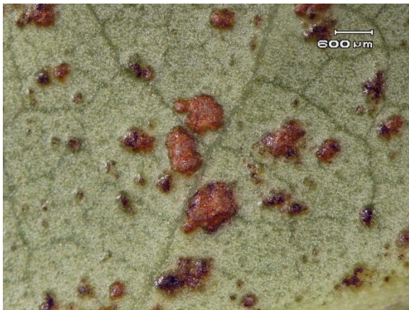
Figure 10. Close-up view of corky oedema lesions.