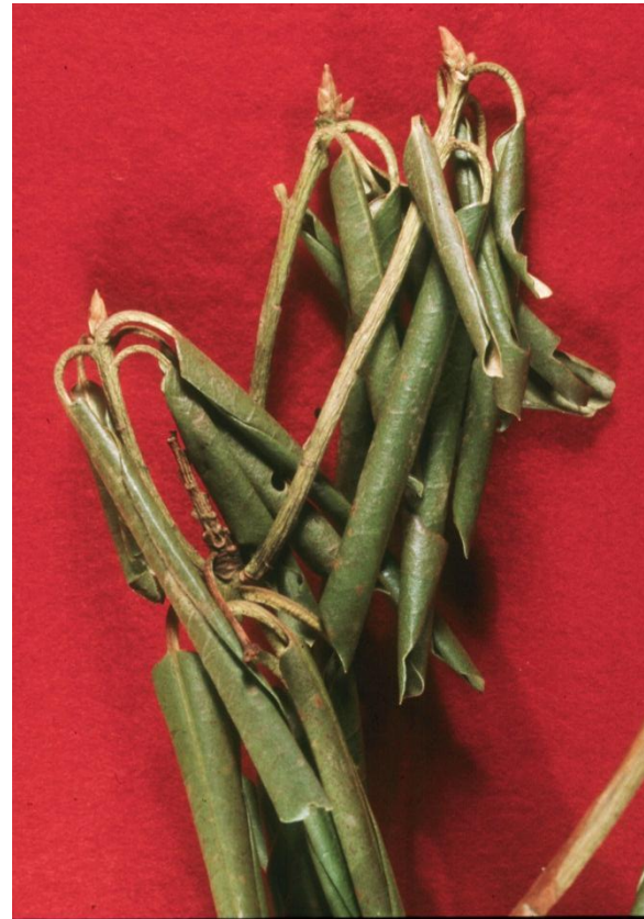
Figure 8. Diagnostic olive-green, inward curling leaves associated with Phytophthora root rot.

damage, soil compaction, nematode damage, and other root diseases.