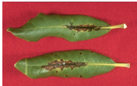
Figure 11. Rhododendron leaves with symptoms of leaf flooding.

Symptoms: Leaves initially develop dark, water-soaked blotches as a result of water infiltrating the intercellular spaces, especially along the mid-vein. Under normal conditions, these air-filled intercellular spaces comprise 10-20% of the leaf. The extent of flooding depends upon the duration of favorable conditions and cultivar. On some plants, flooding can disappear after conditions improve. On others, the blotchy areas become necrotic (Figure 11). Nova Zembla is highly susceptible whereas Roseum Elegans rarely develops leaf flooding symptoms.