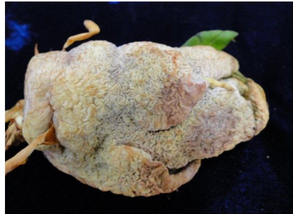
Figure 7. An aging gall that is turning brown and shriveling.

fungus overwinters in bud scales and infects tender tissues as they are emerging.