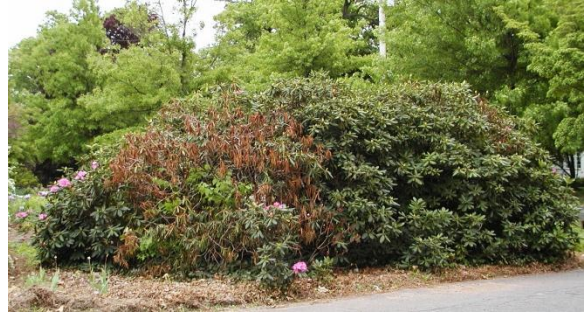
Figure 12. Winter injury symptoms on one portion of an established plant.

Symptoms: Winter injury or winter drying of rhododendron and azalea commonly occurs on plants growing in both wind-swept and sheltered locations. This is a general term applied to a group of environmentally-caused problems that have little in common other than they occur during the winter. Winter injury is important in and of itself, but it also predisposes the plants to secondary invaders or opportunistic pests. Quite often, the effects do not show up immediately after the damage has occurred. Symptoms can develop on one or two individual branches or on the entire shrub (Figure 12). They can appear as tip or marginal browning of leaves, dieback of tips and branches, desiccation of growing tips or twigs, and longitudinal rolling of leaves along the mid-vein (Figures 13 and 14). Water evaporates from the leaves on windy or warm, sunny days and cannot be replaced since the water in the soil is still frozen or unavailable to the plant roots.