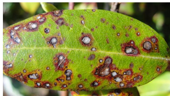
Figure 2. Characteristic leaf spots with distinct margins.