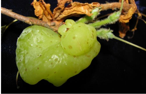
Figure 5. Young, pale green, fleshy gall on azalea.

are more susceptible than hybrid rhododendrons. Leaves and buds are infected as they emerge in April and May. Affected leaves, stems, and flowers become distorted, thickened, and bladder-like. They are succulent and fleshy (Figures 5 and 6).