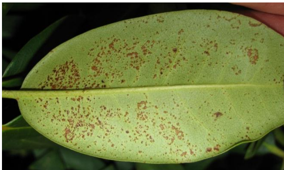
Figure 9. Oedema of rhododendron: upper leaf surface with pale chlorotic areas (top photo); brown, corky blisters (bottom) associated with oedema.