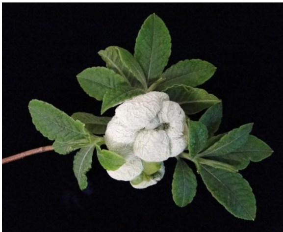
Figure 6. Older azalea leaf gall covered with the white spores of the fungus.

Galls are initially pale green in color, but develop a white “bloom,” which consists of spores of the causal fungus. The galls eventually turn red and brown and shrivel into hard masses (Figure 7). The severity of the disease usually depends on the weather and history of disease. Favorable weather includes prolonged bud break due to cool temperatures and adequate rainfall or dew to provide free water on the plant tissues. The