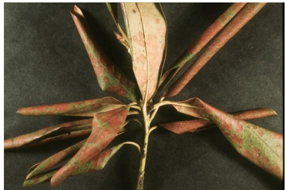
Figure 14. Close-up of winter injury symptoms.

Plants that have been recently transplanted and lack well-developed or established root systems are most susceptible to winter