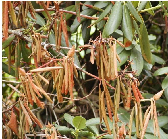
Figure 13. Diagnostic symptoms of winter injury including rolling of the leaves along the mid-vein.