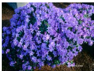
'Blue Ridge' <- Lepidote, purple flowers.

These and other beautiful pictures can be seen on line at http://www.pbase.com/bstelloh/searsp4m2014 .