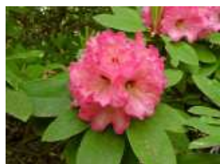
H47 <- darkish pink, red blotch, frilly, fragrant.