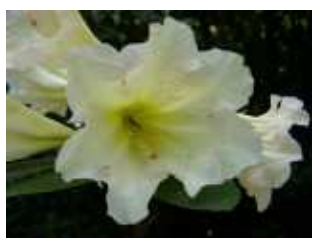
H45 -> very pale yellow, wavy edges, fragrant.