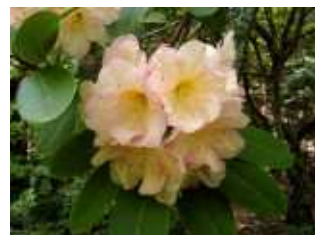
H49 <- 'Superba'- (fortunei x Goldsworth Orange), good truss.