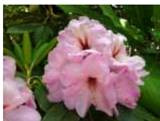
H43 <- pale pink, red blotch.