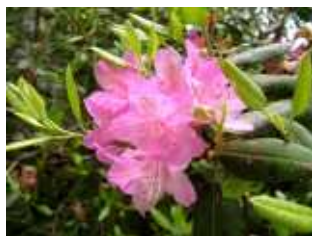
H40 -> lepidote, pink, floriferous, long bloomer.