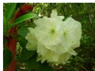
H48 -> white, semi-double, fragrant.