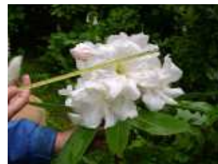
H56- Large white flowers.