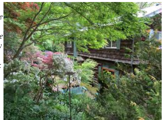
Azaleas grace the bank along the driveway toward the back of the house.