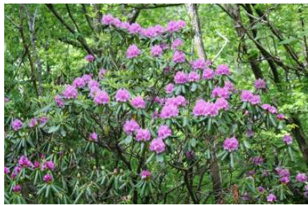
Catawba at Crabtree Falls Visitors Center

members, which included Craggy Gardens; flames (orange) and the end of the vaseyi (pink) on the Blue Ridge Parkway between Asheville and Cherokee, flame azaleas may be starting at lower elevation; Blue Ridge Parkway from Asheville to Mt. Mitchell; The North Carolina Arboretum for Gregory Bald azaleas, some Flame and some of the Cumberland hybrids; higher areas such as Mount Mitchell, Mt. Pisgah,