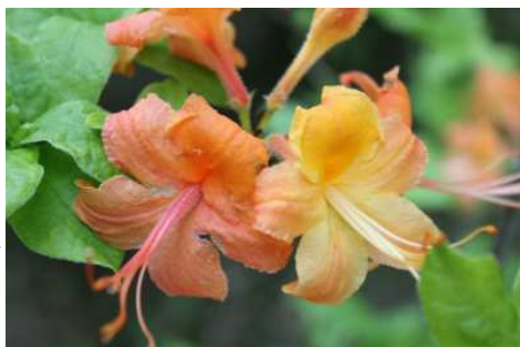
Flame at Linnville Falls Visitors Center