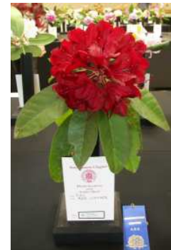
Boris Bauer's Red Wonder