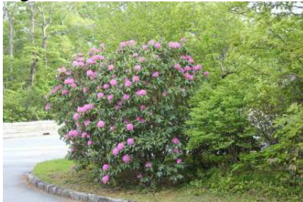
Catawba at Linn Cove Visitors Center

Balsam Mountain; and the Foothills Parkway in eastern TN for Mountain Laurel.