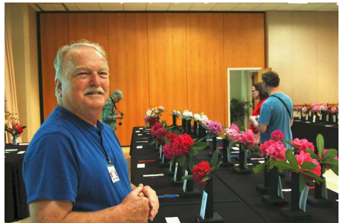
Many thanks to Glenn O'Sheal for heading up another outstanding flower show!