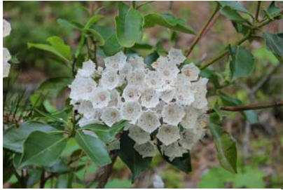
Mountain Laurel on the Foothills Parkway in TN.

I received an e-mail from some folks in Miami, requesting information on the expected blooming of Catawba Rhododendrons in our area, time-wise and quality-wise, around May 23-25? "We're also interested in the R. Vaseyi, Mountain Laurel and Flame Azalea." the writer said.