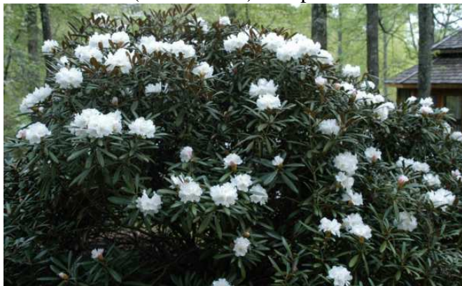
yak x smirnowii

The program will include a history of yaks (Rhododendron degronianum ssp. yakushmanum) in the garden, how to grow them, and a virtual tour of Yakushima (Yaku Island) in Japan.