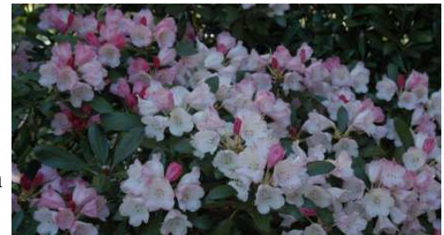
Yak grown from Yakushima seed