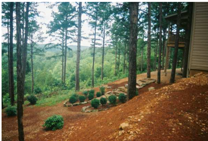
Lower southeast backyard at Shady Grove

Gardening here involves rocky soil and dealing with wildlife, but the sense of space and serenity is incomparable. My home and garden are on a south-facing slope, under a canopy of short leaf pines, with a priceless view of the Ozark hills. Fallen pine needles carpet the ground, with a