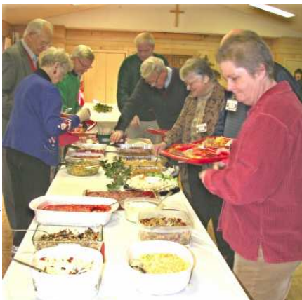
Christmas Party food table last year