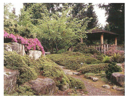
Rhododendron Species Botanical Garden

dates are April 29 to May 3, 2009. The ARS Board meeting is on Wednesday, the 29<sup>th</sup> and tours start on Thursday, the 30<sup>th</sup>. There will be a half day of educational workshops on Saturday.