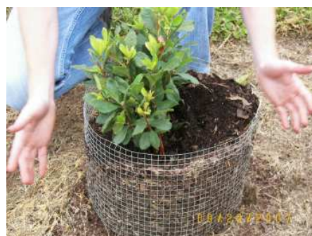
6-10 rooted cuttings from ‘our’ plant.

project, Jeff Jones showed us a field where “our” plants had been planted and allowed to establish before they were hedged severely to within 6” of the ground. The many new stems were mounded (covered) with up to 15” of substrate in a wire mesh to exclude light and provide an environment conducive for root formation. The objectives are to develop protocols for propagation of R. flammeum and R. austrinum by manipulating stock plant management techniques, rooting hormones, and