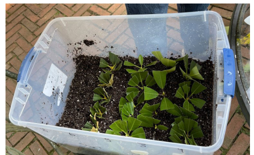
One set of 1st cuttings