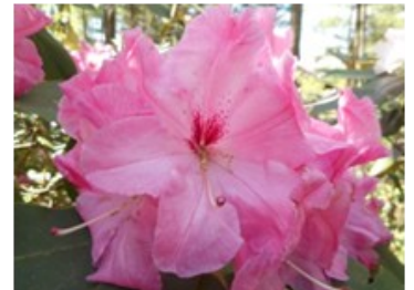
131- Jean Marie de Montegue x Recurvoides - pink flower w/ blotch, large plant