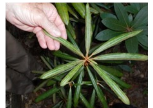
137-Yak Exbury x degronianum x selfed (ARS seed), long thin leaves