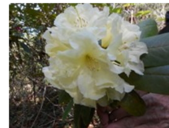
125- Golden Star x Mezzitt x Hardy Yellow x Phipp's #32