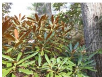
107- Metternichii (Gable) - cinnamon indumentum, narrow leaves