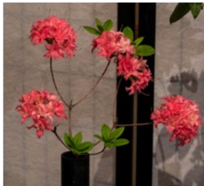
Best Deciduous Azalea: Homebush — by Glenn O'Sheal