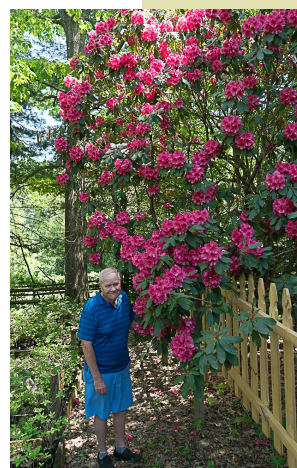
Doley's Big Red