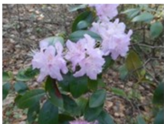
101- Windbeam - pink lepidote