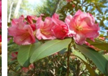
116- 2HPPB Cowles (1987) -dark pink flower