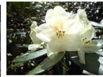
130- Yak Wada x Marie Starks -3' tall, no indumentum