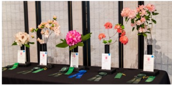
2016 Flower Show Winners