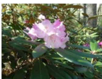
104- Yak—Kehr — pink flowers, good indumentums, 6'