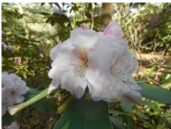
121- Van Ness Sensation- large pink flowers, good truss