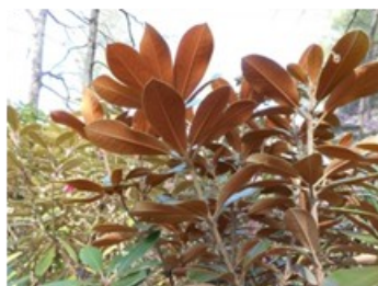
106- Gretzel-Cinnamon indumentum with upright leaves