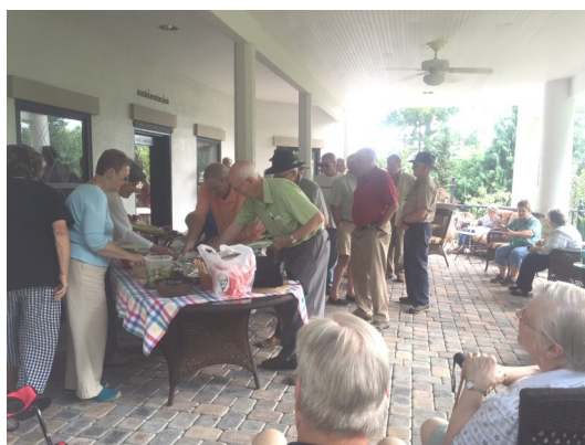
Last year's picnic.