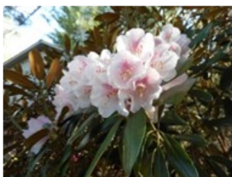
102- SIMIARUM x Yak-446 Kehr —5' tall