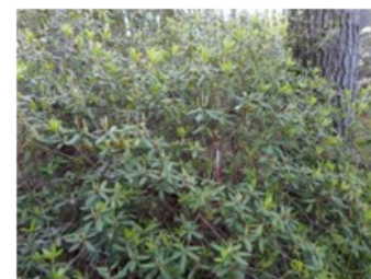
110- Keiskei -6' (done blooming by April 21)