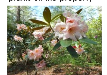
115- 2H2784 SW, 296 x Yak , 3' tall