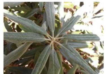
134- Metermichii variety Kyomaruense narrow leaves, white tomentum