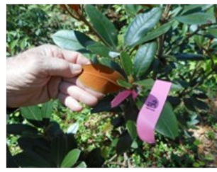
136-Cinnamon Bear- Yak Wada x Bureavii