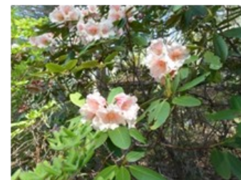
111- Vernicosum #18139 -large pink truss