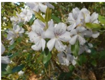
119- Ovatum- Gable selection