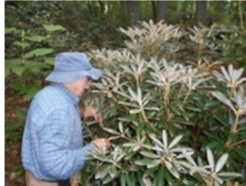
108- Yak Wada x unknown , white tomentum, Leon in pic