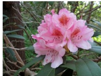
128- Bashful-yakushmanum - 3' to 4' tall, slow-growing, compact delicate pink