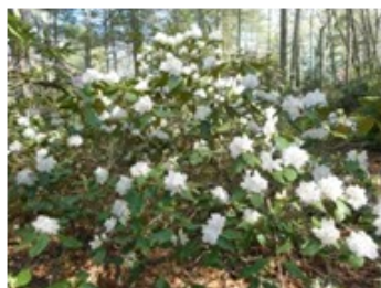
105-r. Carolinianum x Epoch (Kehr