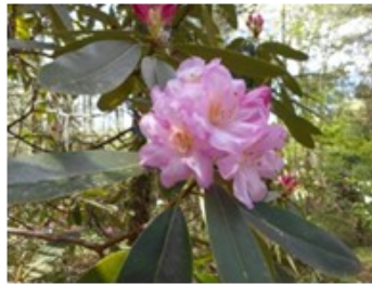
122- Warwick -round pink truss, large plant