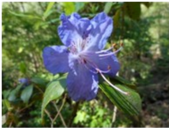
118- Crater Lake x Blue Ridge- (Kehr) 1992