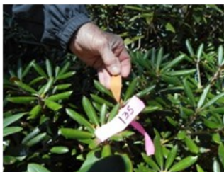
135-Yak Exbury- selfed