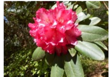
132- Cowles Hybrid , un-named, red and white bi-color flower