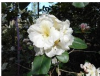
103- Scintillation x Skipper (Holly)-large yellowish-cream truss