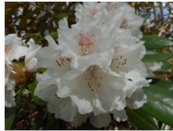
127- Smirnowii x Yak - white flower w/ red freckles, 10' tall, indumentum