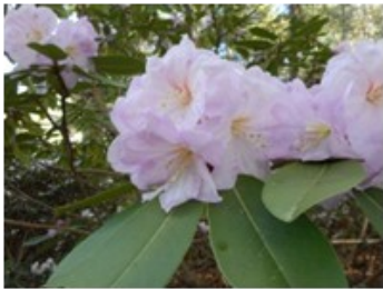
120- Auriculatum- big pink flowers, 15' tall, scented, OP seedling