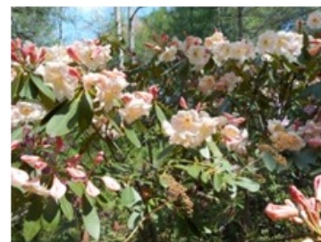
113- Cowles hybrid - Butter and Eggs-yellow