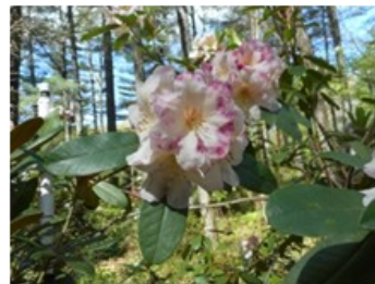
129- Dexter's Springtime