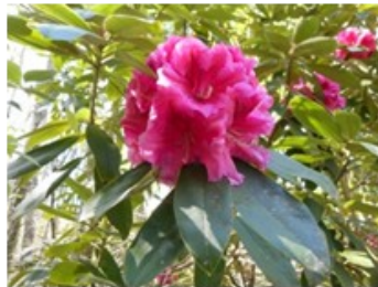
124- Dorothy Russell- Red w/ freckles, good truss, 10' tall