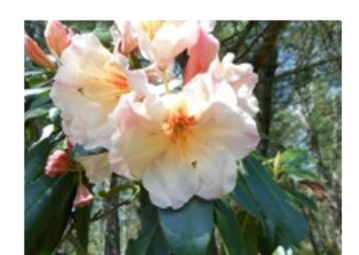
114- 1H2185B-Cowles hybrid -nice bloomer, 3-4 plants on the property