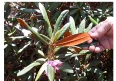
133-Sir Charles Lemon x Yak- cinnamon indumentum, somewhat narrow leaves - Leon in pic