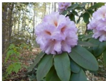
123- "1000 butterflies"x Red Yak x Dexter's Purple x Yak (Minch) lavender, frilly