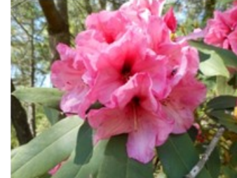
112- LH4285-Cowles hybrid -big dark pink truss with red throat