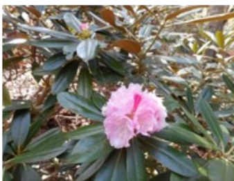
109- Yak Exbury x Metternichii , light brown indumentum