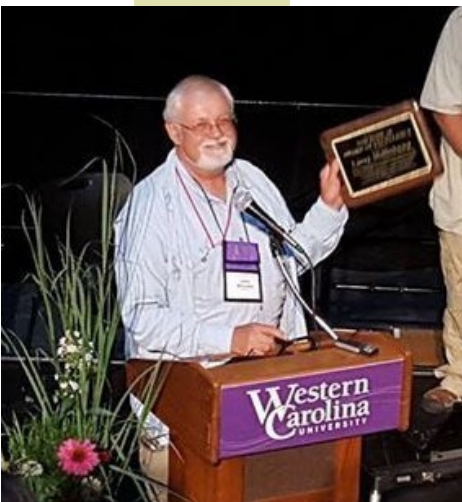
Native Plantsman of the Year