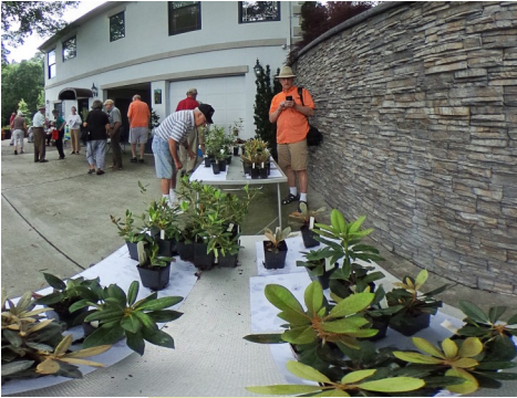
Great Selection from Collins' Garden