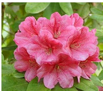
Dexter's Gigi -- Flower vivid purplish-red with deep red spotting; -- 5 feet in 10 years. Elepidote