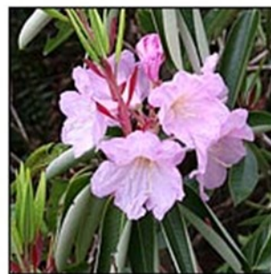
Dexter's Peppermint -- Flower color is a mixture of pale pink lilac to white with yellow green spotting in the throat. Sweet Fragrance, like peppermint -- 4 feet in 10 years. Elepidote