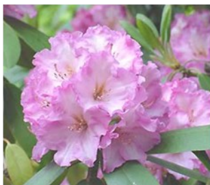
Rona Pink Dexter - Flower wavy edges, inside purplish-pink shading lighter on midribs and with sparse yellow-green spotting on dorsal lobe, -- 5 feet in 10 years. Elepidote