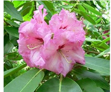
Mrs W. R. Coe Dexter -- Flower deep pink with a crimson throat-- 6 feet in 10 years. Elepidote