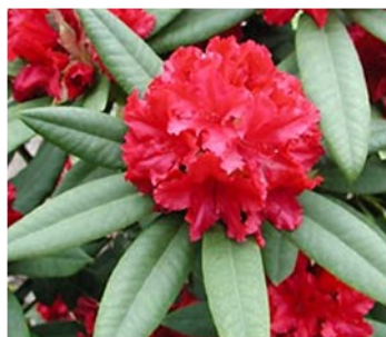
Vivacious -- Flower are strong red, no markings; ball-shaped trusses of 10 or more ruffled flowers in varying degrees of intense red -- 3 feet in 10 years. Elepidote