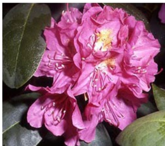
Spring Dawn -- Flower funnel-shaped, 2½" across, rosy pink with a golden yellow blotch; round-shaped flower truss -- 6 feet in 10 years. Elepidote