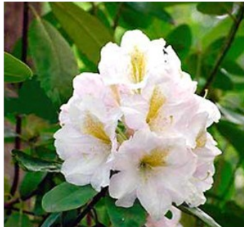
Merley Cream Dexter -- Flower greenish-white tinged pink, with a yellow flare in the upper lobes. 5 feet in 10 years Elepidote