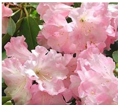
Wareham Dexter -- Flower is fragrant, light purplish-pink with faint strong greenish-yellow spotting -- 6 feet in 10 years. Elepidote

Two additional cuttings might be available. No information could be found on these: