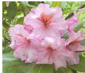
Brown Eyes - Dexter Flower pink with a golden-brown flare on upper lobes -- 6 feet in 10 years. Elepidote