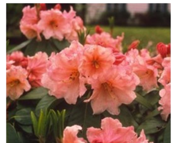
R. vernicosum-Rock #18139 -- from seed collected by Dr. Joseph F. Rock in China in 1929. Heavy bloomer with large orient pink flowers with a deeper color in the throat. 8 to 10 feet in 10 years.