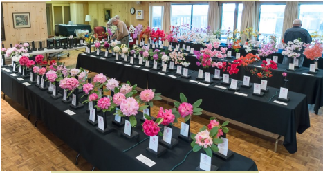
A wonderful collection of cuttings