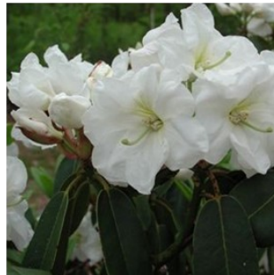
Helen Everett Dexter -- Pure white highly fragrant flowers, are often partially double. -- 4 to 5 feet in 10 years. Elepidote