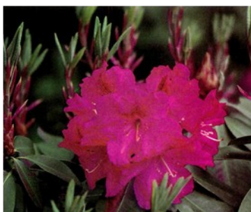
Tripoli-Ross EEE Dexter -- One of the darkest-colored Dexters, dark reddish pink (or pinkish-red) with a freckled dark blotch. 5 feet in 10 years.