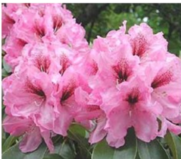
Ben Mosley - Dexter Flower light purplish-pink with darker edges and deep reddish-purple blotch. 5 feet in 10 years. Elepidote