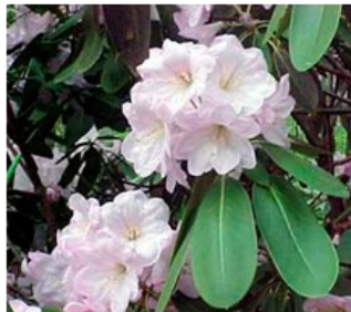
R. Fortunei - Openly to funnel campanulate, pale lavender or pale pink to white, fragrant. -- 6 feet in 10 years.