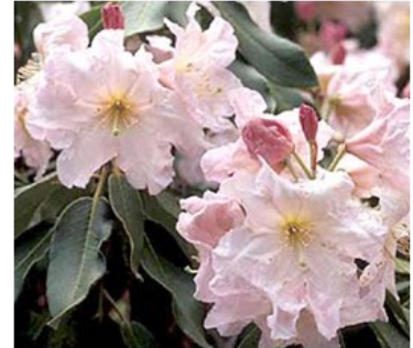
Dexter's Honeydew -- Flower very fragrant, pale purple at margins with greenish-white center and light yellow throat. 4 feet in 10 years. Elepidote