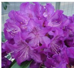
Florence Parks -- Cold-hardy darker purple, heavy-flowering, 5 to 6 feet in 10 years.