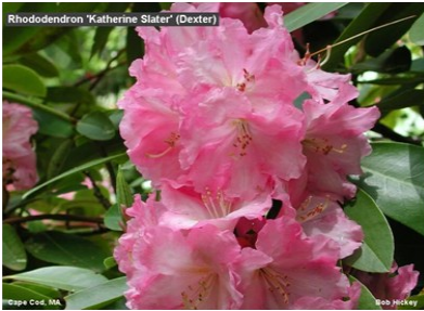
Katherine Slater Dexter -- Large frilly pink and white trumpet-shaped flowers, greenish-yellow blotch, lightly-scented conical truss. 8 feet in 10 years.