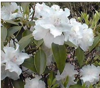
Molly Fordham Dexter -- White flower with greenish-yellow highlights- 4 feet in 10 years. Lepidote

NO PIC— Ted's Apricot - Interesting hybrid raised by the late Ted Millais. The buds are a deep apricot color, opening to attractive creamy bell-shaped flowers --3 feet in 10 years