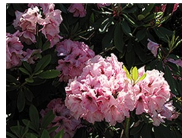
True Treasure Dexter -- Shell pink blooms with a dramatic deep red blotch; an excellent choice to mass in groupings, or as an elegant focal point of the garden. 5 ft. high x 6 ft. wide in 10 years.