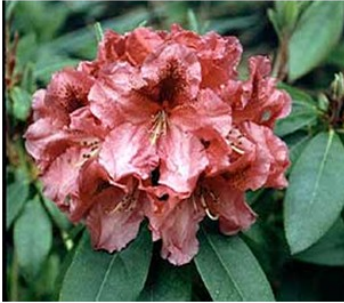
Glenda Farrell Dexter -- Flower bright orange-red with dark specks and a red blotch; fades to reddish pink. 5 feet in 10 years