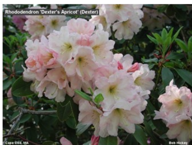
Dexter's Apricot -- a part of a small group of beige-apricot varieties -- 5 feet in 10 years. Elepidote