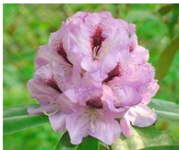
A. Bedford Flower fragrant, pale mauve tube, darker lobes with a brownish-red blotch. 6 feet in 10 years.

Most of the plants are Dexter Hybrids. Last July the cuttings were taken to Transplant Nursery to be propagated. We never know which ones will root or how many will survive until the day before the sale. The rooted cuttings will be sold for $3 each