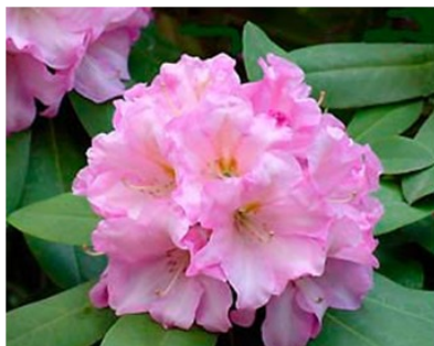
Tom Everett Dexter. Rhododendron of the Year award - 2015 - Flower deep purplish-pink paling to near white in throat with vivid greenish-yellow faint spotting, fragrant -- 4 ft. in 10 yrs. Elepidote