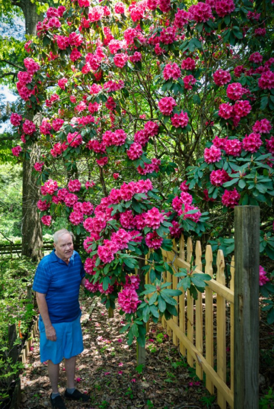
A 2016 pic from the Bell Garden