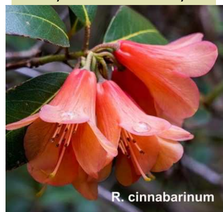
Rhododendron Species Foundation