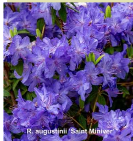
Whitney Garden & Nursery