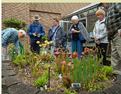
At the UNC Greenhouse