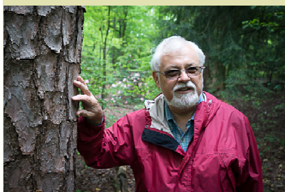
Tour Guide at UNC