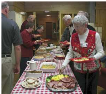
Members enjoy the array delicious food at last year's Christmas Party.