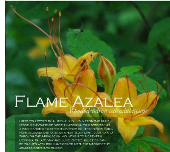
Mock up of one of seven Exhibit panels