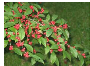
Deciduous Holly, "Harvest Red"