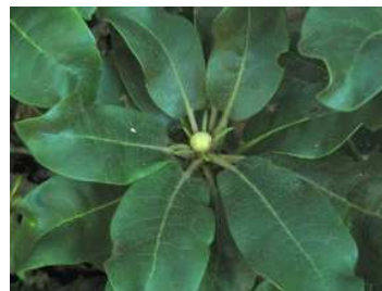
Upper left, Girard's Crimson in November; upper right, R. eastmanii buds; left, Wavy leafed Max; lower left, Indumentum of a Yak hybrid; lower right, R. Bear Claw plant; and bottom, R. Goldflimmer.