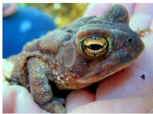
"Who let you in?"

"Someone saw the toad and it hopped under the